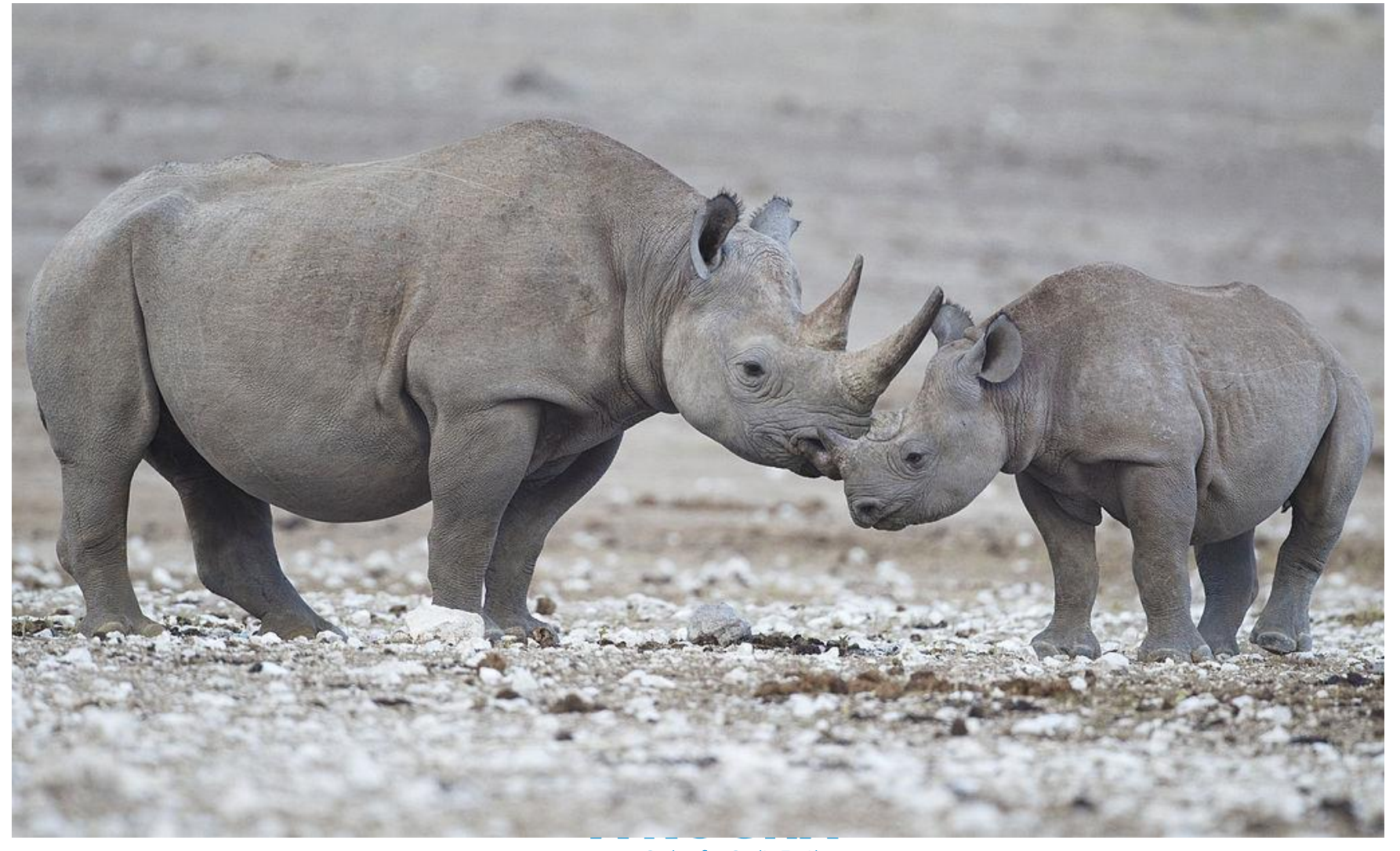
Caring for God's Earth