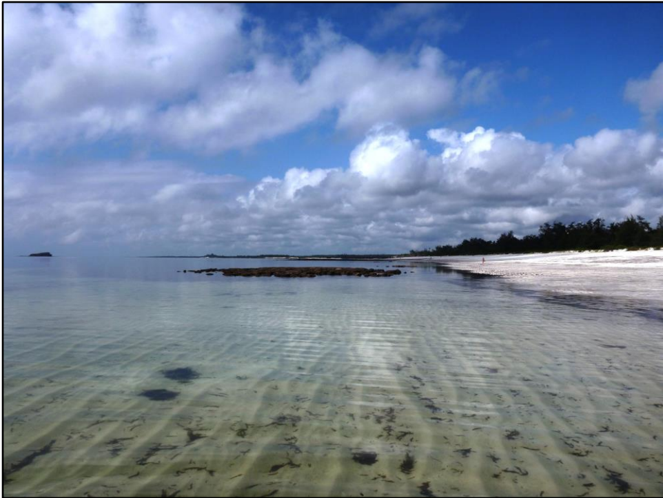
Study site in Kenya where we are working in Watamu Marine National Park out of our field study centre.